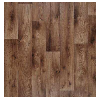
CAMEO 3400 2/3/4m 100 cm x 100 cm