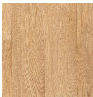
FALCO 1159 2/3/4m 100 cm x 100 cm