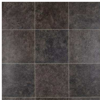
FIONA 9179 2/3/4m 100 cm x 100 cm