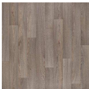
FALCO 9359 2/3/4m 100 cm x 100 cm