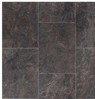
KEZZI 8402 2/3/4m 100 cm x 100 cm