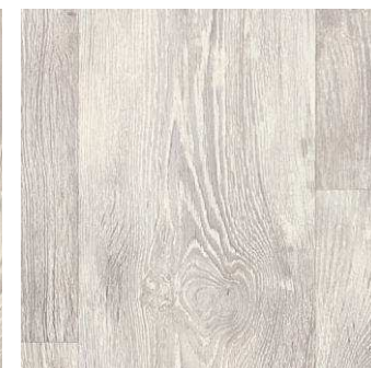
SAMSON 6081 2/3/4m 100 cm x 100 cm