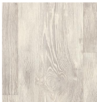
SAMSON 6080 2/3/4m 100 cm x 100 cm