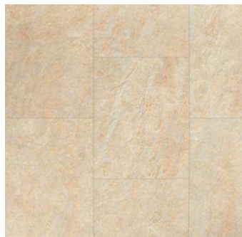
KEZZI 7002 2/3/4m 100 cm x 100 cm