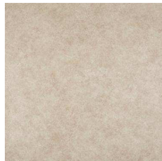
ATLANTIC 7698 2/3/4m 0 cm x 0 cm