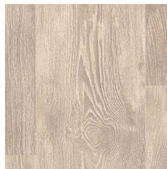
SAMSON 8181 2/3/4m 100 cm x 100 cm