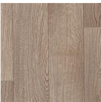
FALCO 9159 2/3/4m 100 cm x 100 cm